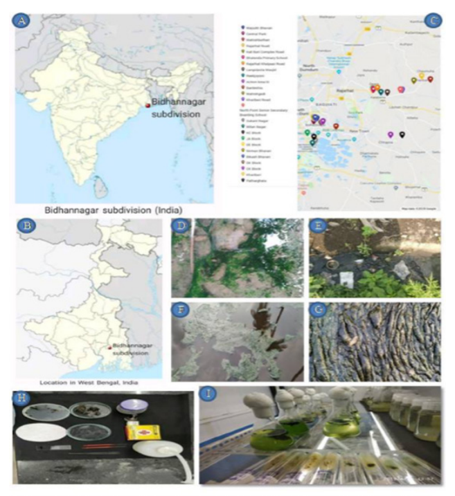
A, B & C : Maps showing different collection sites of Bidhannagar Subdivision, (W. B) D, E, F & G: Mode of occurrences & distributions of different freshwater cyanobacteria H : Isolation and identification of freshwater filamentous cyanobacteria. I: Maintenance and preservation of pure culture both in liquid and solid medium.

Cyanobacterial diversity from freshwater habitats of district North 24 Parganas, West Bengal, more specifically