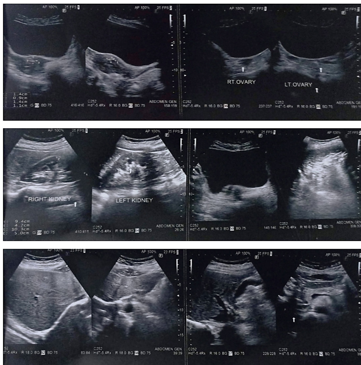
Figure 2: Real-time ultrasound sonography of abdomen and pelvis post treatment.

development, metabolism, and adaptation, significantly influencing immune system function and immune cell activity. [14] Copper containing traditional organometallic formulation, Tamra Bhasma , has been used for centuries for Rasayana (rejuvenation) purposes. Zinc is being used in Trivanga Bhasma , Zinc predominantly has shown significant improvements in gynecological conditions. In a study of 66 individuals, consumption of Zinc supplements at therapeutic doses has shown significant relief in severity of dysmenorrhea. [15]