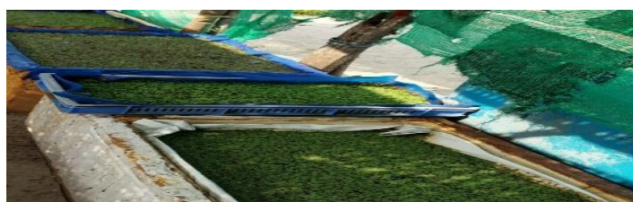
Figure 1: Sample collection from Mandabam, South coast of India.

The plant materials were soaked into various solvents such as methanol, ethanol, benzene and acetone for preparing good quality of extracts. 25 grams seaweed